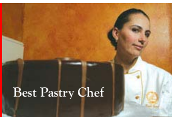
Best Pastry Chef